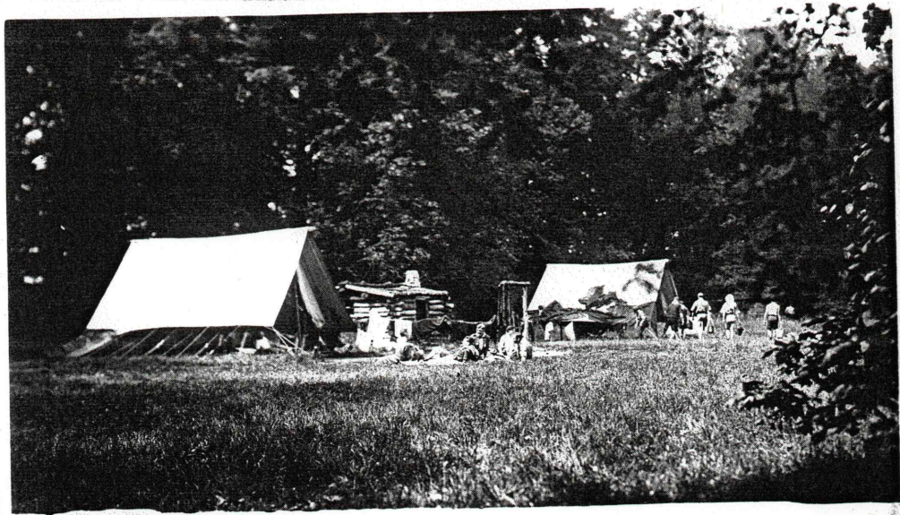
A GLIMPSE OF TRAINING GROUND - GILLWELL PARK. Farrington