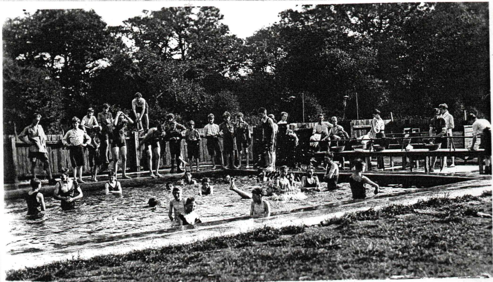
THE BATHING POOL.