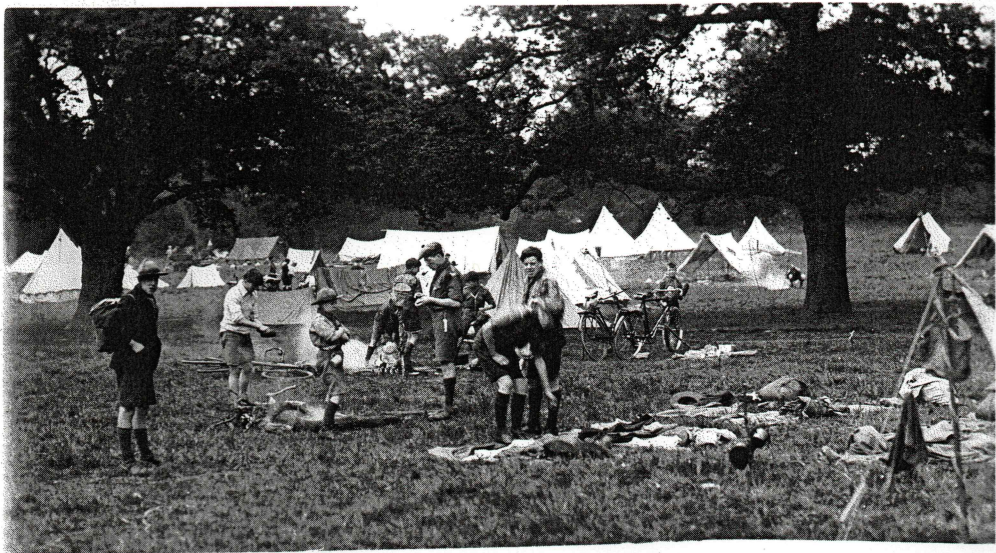
Boys Camping Ground. Gillwell Park.